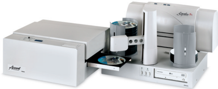
Accent Laminator configured with Composer XL Duplicator and SignaturePro Printer

To laminate just a few discs at a time, simply place a disc in Accent's input tray and press "Laminate." The lamination process is fast – just 10 seconds per disc. For completely automatic burn/print/laminate operation, Accent easily attaches to Primera's Composer XL, ComposerPro or ComposerMAX Optical Disc Duplicators (optional stands are required).